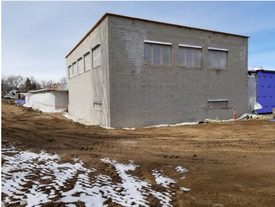
Southeast Elevation; brick, windows, and frames being installed; roof and parapet installation continues