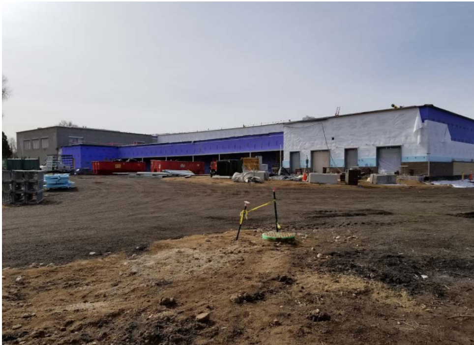
East Elevation; brick, windows, and frames being installed; roof and parapet installation continues