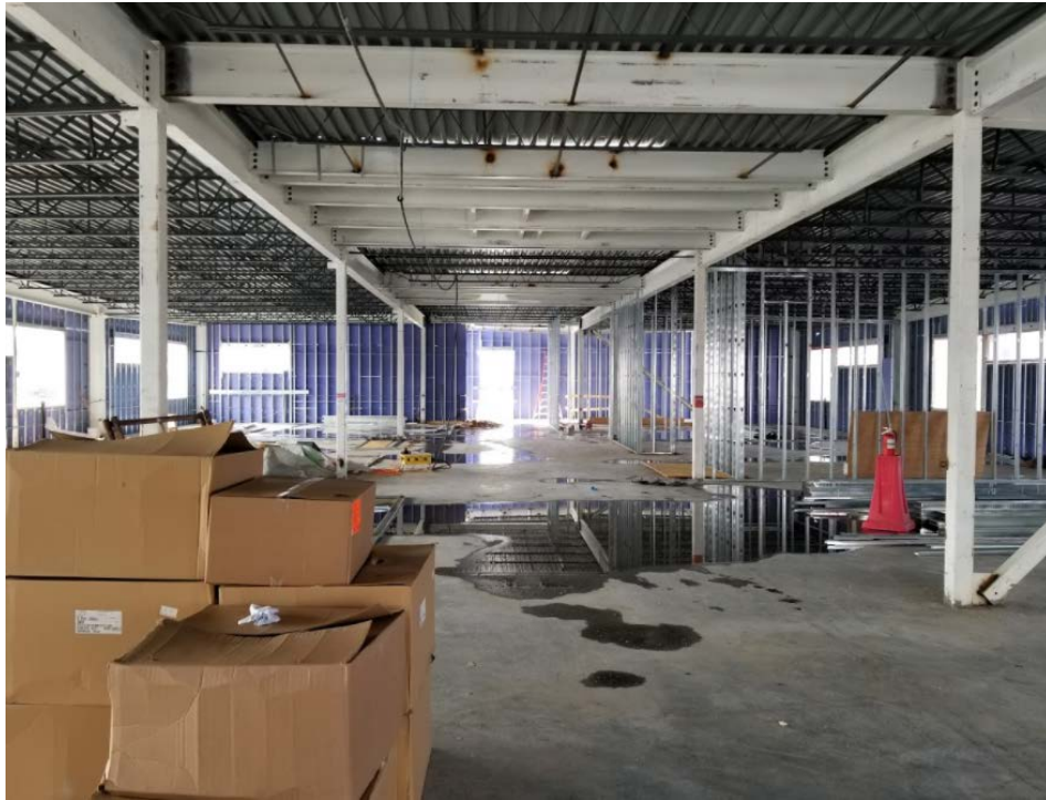
South Classroom Wing – (Upper level) –framing progress