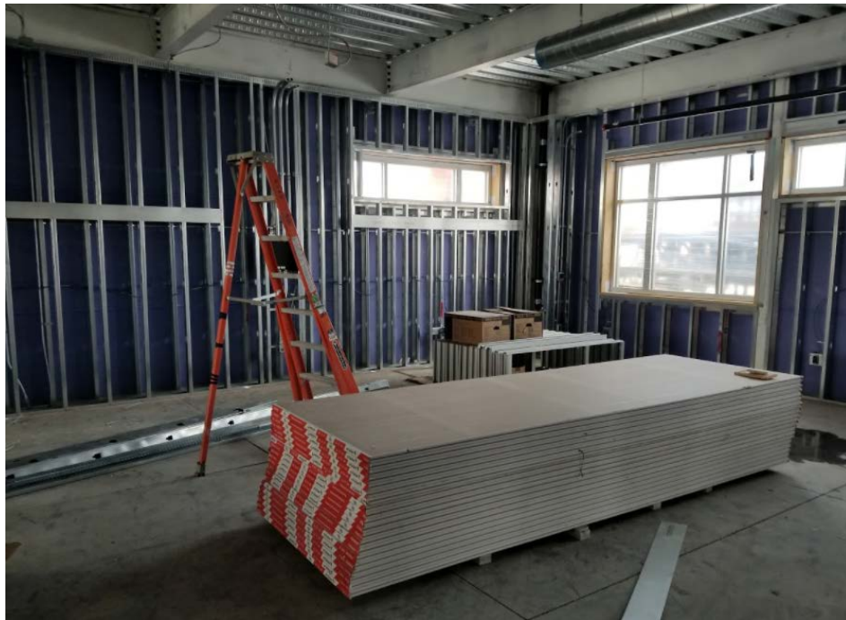
North Classroom Wing - Classroom (lower level) – plumbing, framing and electrical install in progress