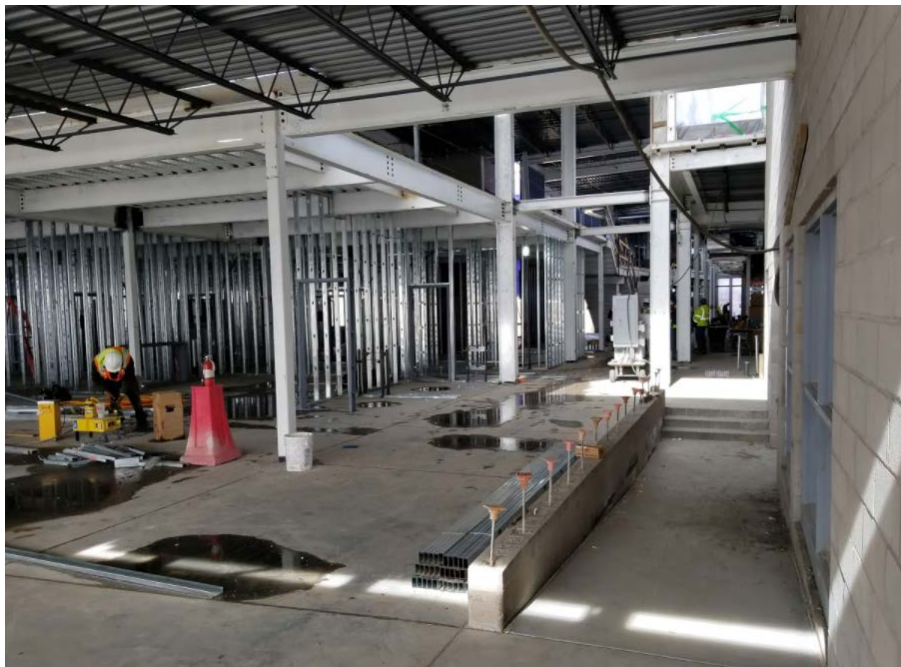
Grand Hall Main Entrance – North Facing View; framing and HVAC being installed