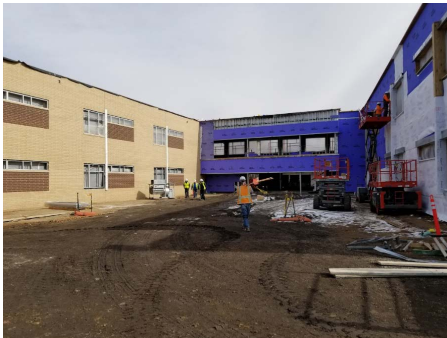
Plaza Area (Between Classroom Wings) – East Facing View; brick and window frames being installed; roof and parapet installation continues