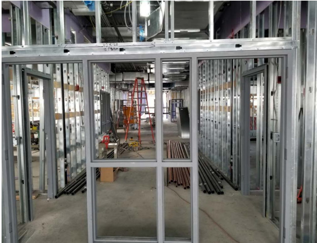
North Classroom Wing (Upper level) – West Facing View; framing and electrical install in progress