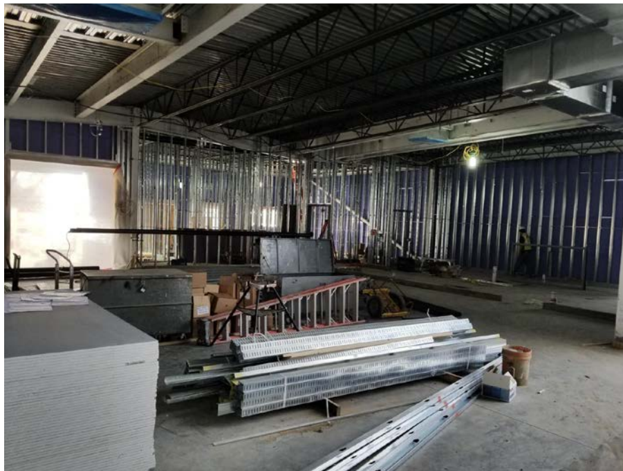
Kitchen and Cafeteria – Northeast Facing View – plumbing, framing and electrical install in progress