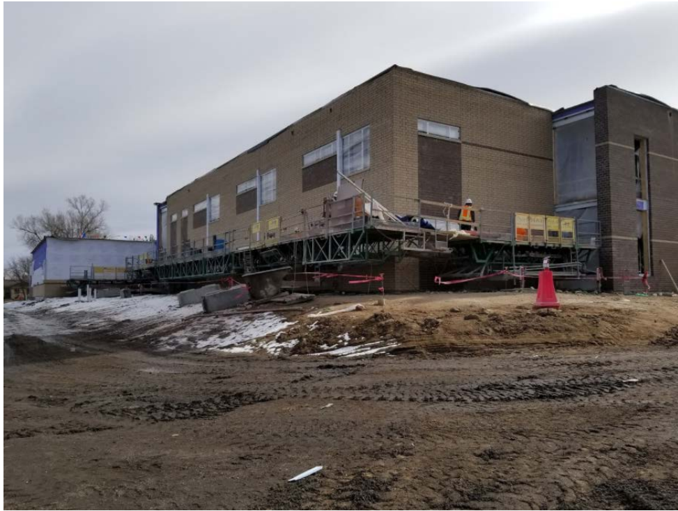
North Classroom Wing – Northwest Elevation; brick, windows, and frames being installed; roof and parapet installation continues