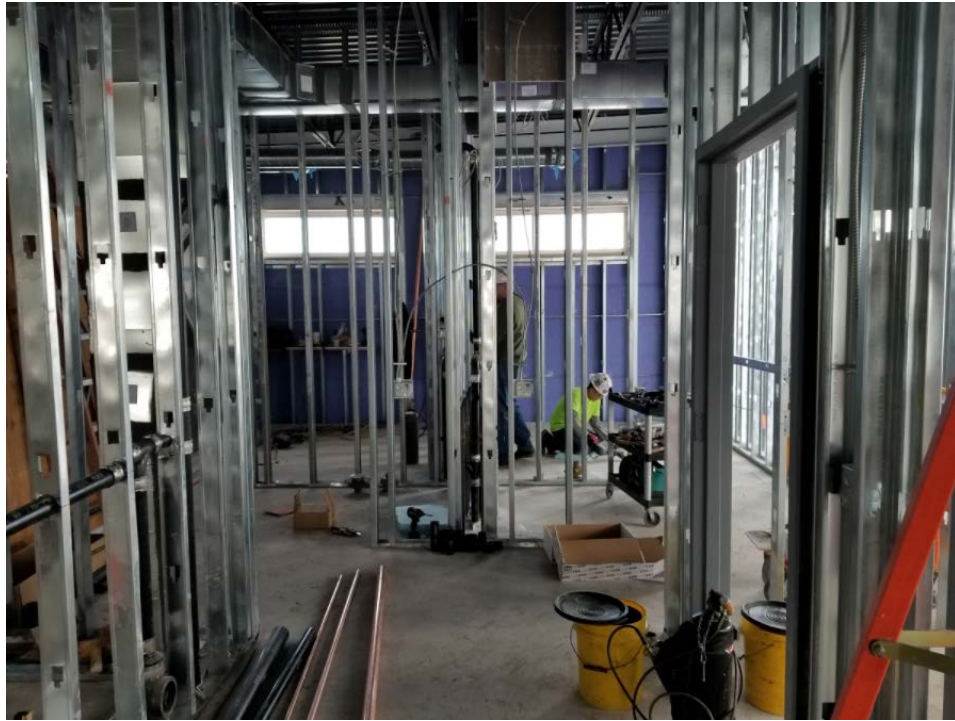
North Classroom Wing - Restrooms (lower level) – North Facing View; plumbing, framing and electrical install in progress