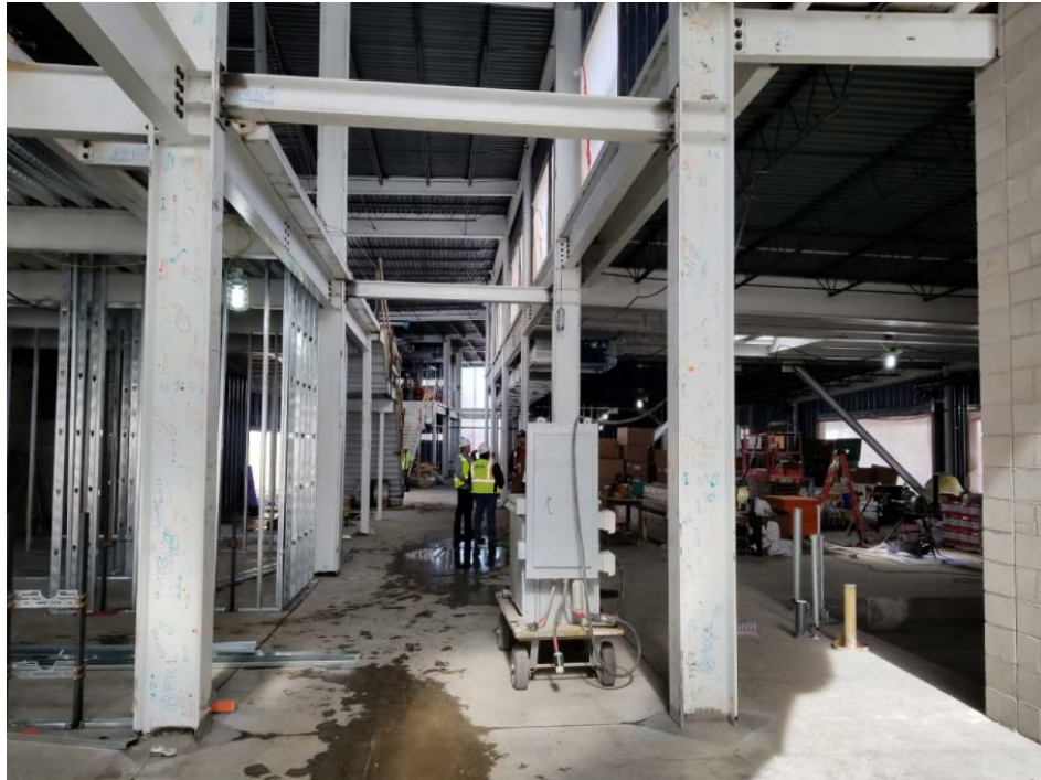
Grand Hall Main Entrance – North Facing View; framing in progress