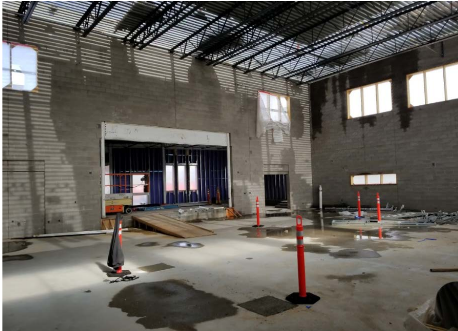
GYM – North View