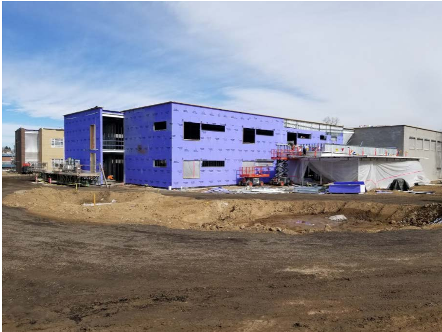
Front Entrance / Gym – Southwest Elevation; brick and window frames being installed; roof and parapet installation continues