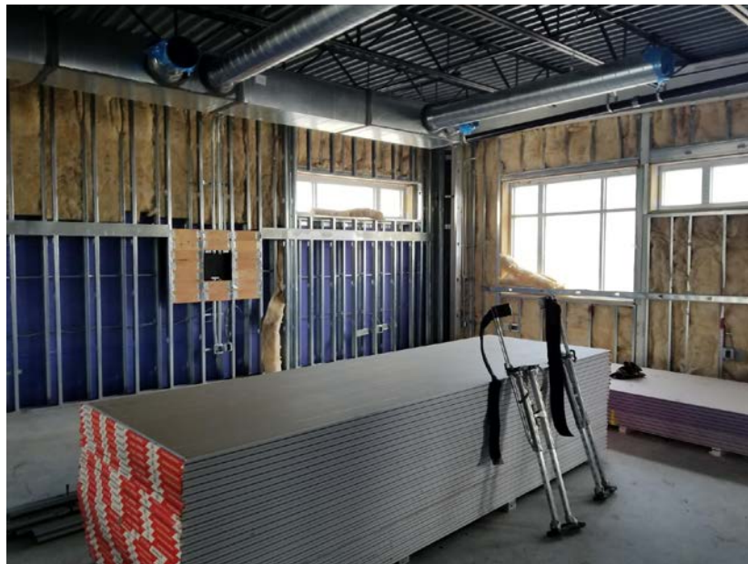
North Classroom Wing – Classroom - (Upper level) – insulation and electrical install in progress