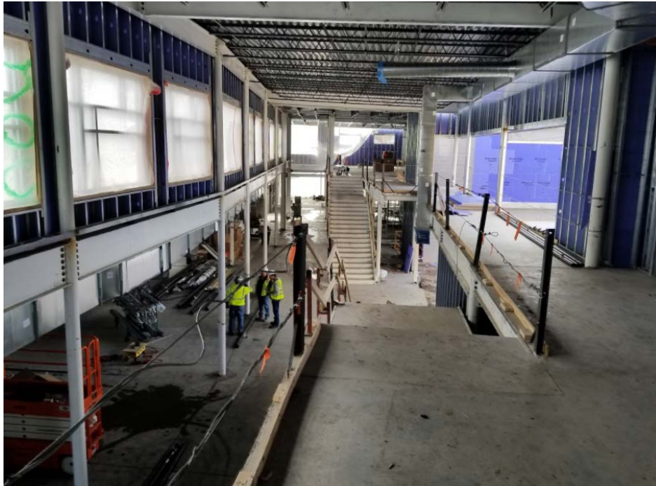
Grand Hall – South Facing View; framing in progress