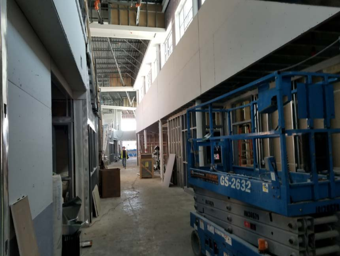
Grand Hall – North Facing View; HVAC, electrical, insulation and drywall install continues.