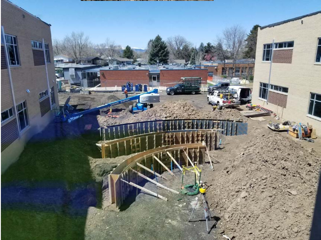
West Elevation – Plaza Between Classroom Wings; Sitework in progress.