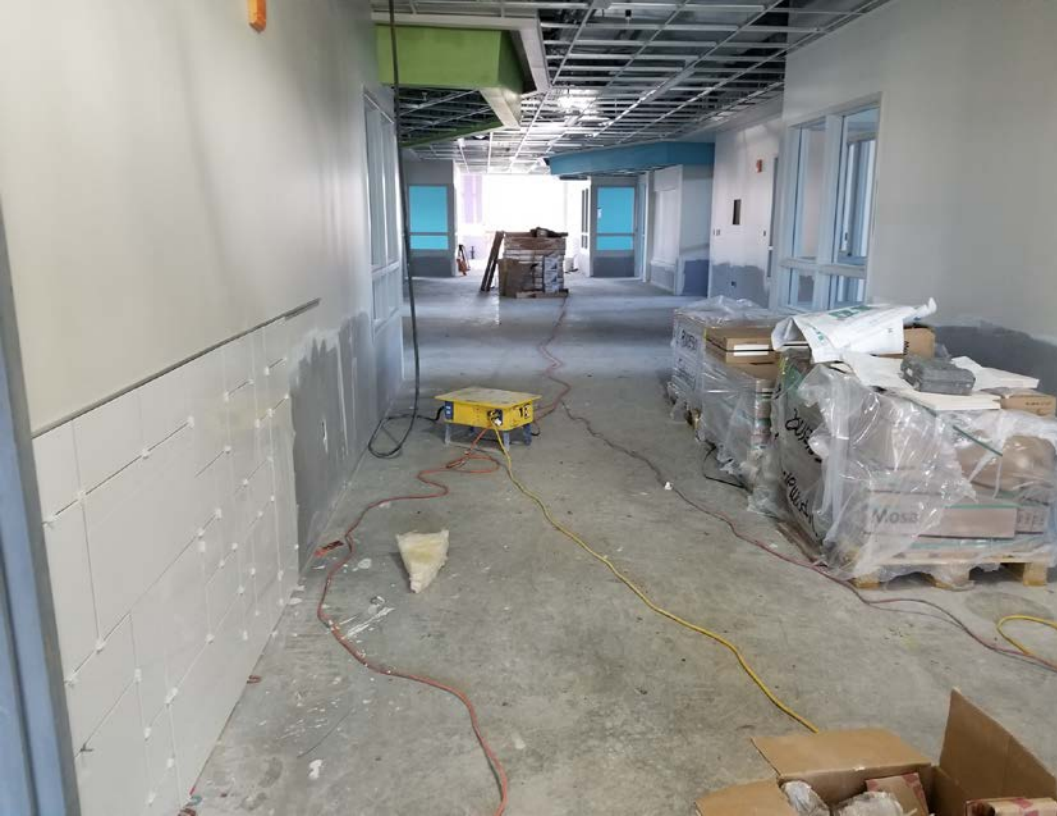
North Classroom Wing (upper level) – Wall tile being installed.