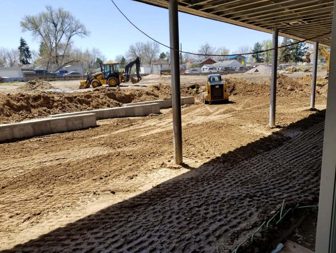
Front Entrance – South Elevation; Sitework in progress.