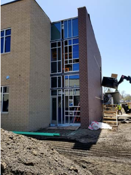
East Elevation –South Classroom Wing; Storefront frames being installed.