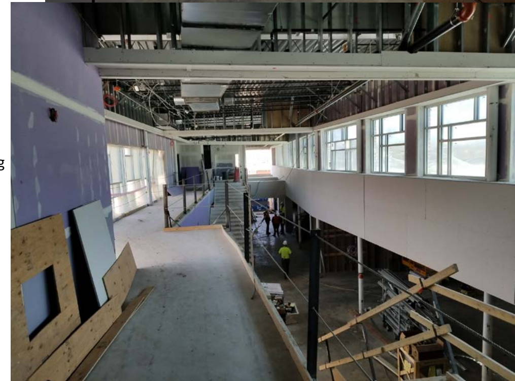
Grand Hall – North Facing View; HVAC, electrical, framing, insulation and drywall install continues.