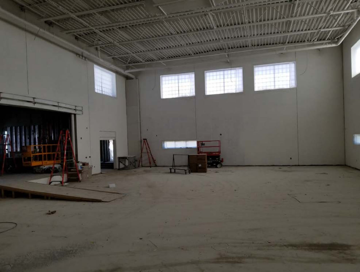
Gym – Painting in progress.