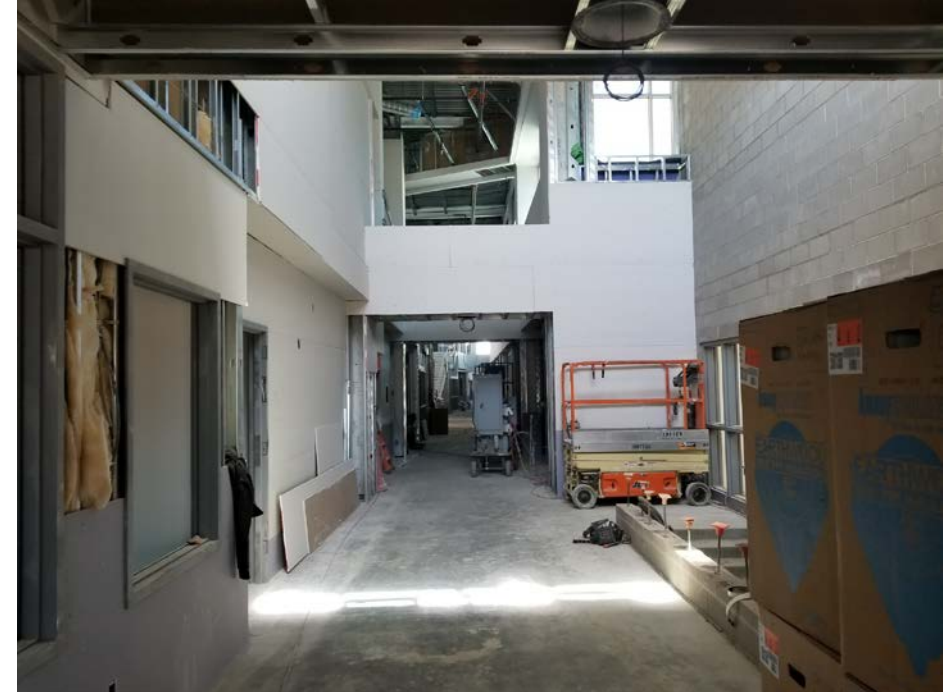
Grand Hall – North Facing View; HVAC, electrical, framing, insulation and drywall install continues.