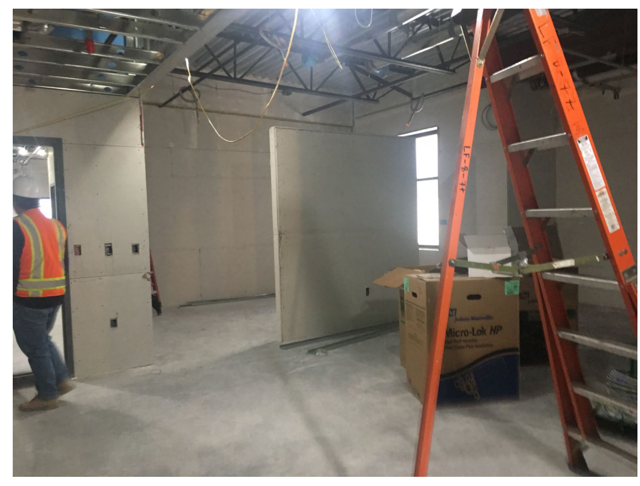
Administration Offices - Drywall