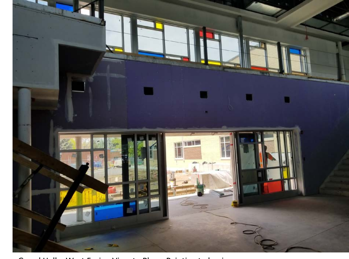
Grand Hall – West Facing View to Plaza; Painting to begin soon.