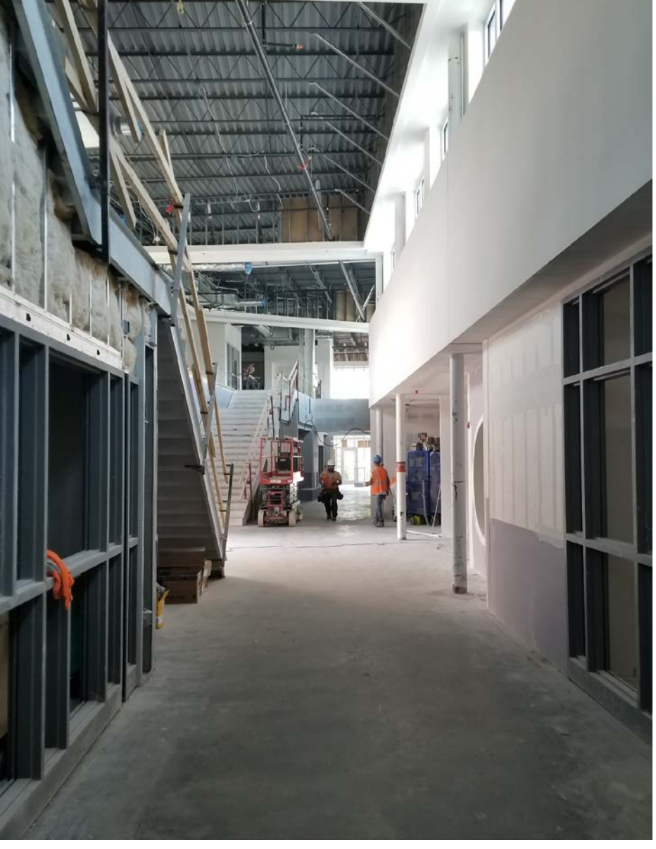
Grand Hall – South Facing View; Drywall install finishing, ceiling being installed, and painting to begin soon.