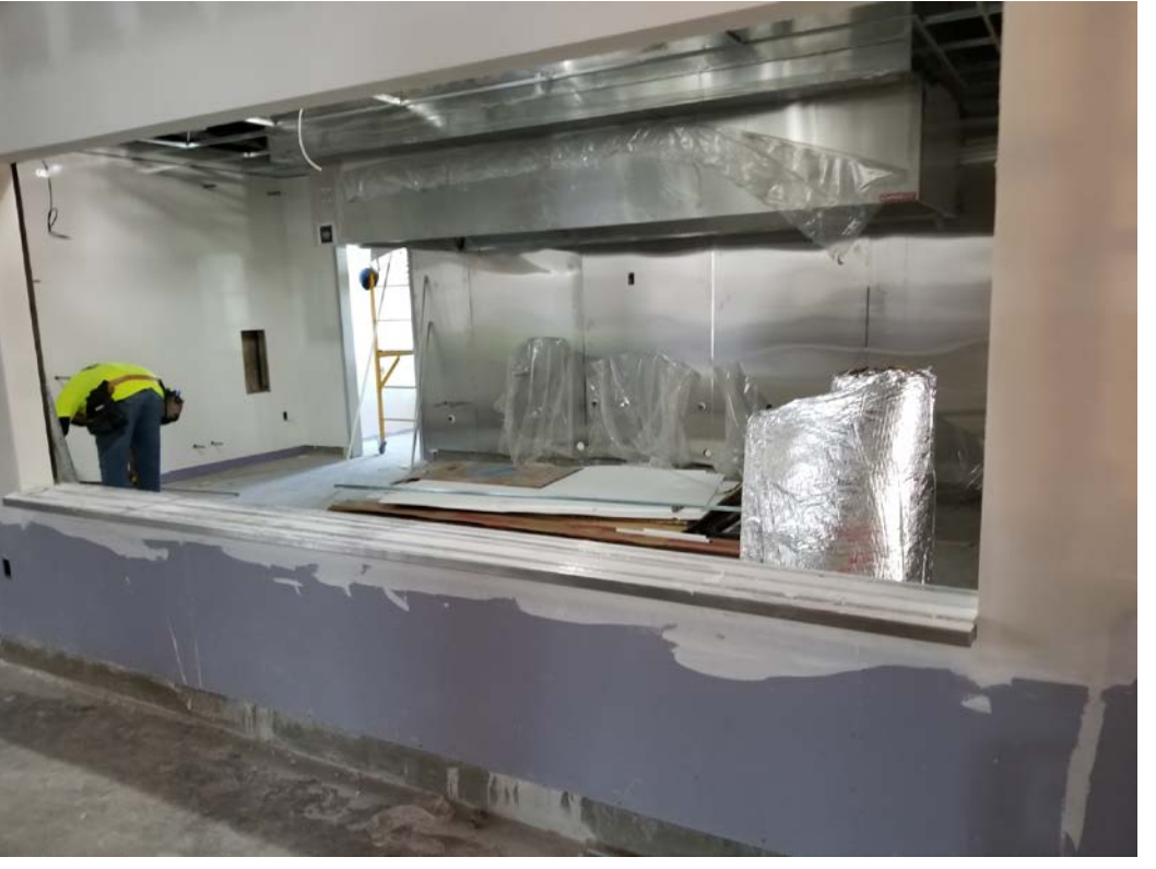
Cafeteria – Kitchen equipment infrastructure being installed.

Learning Commons - Mechanical, electrical, and ceiling work continues.