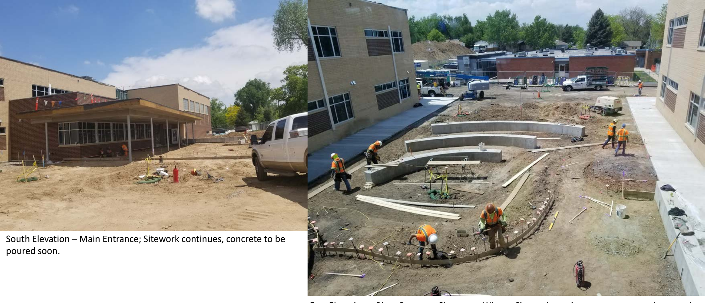
East Elevation – Plaza Between Classroom Wings; Sitework continues, concrete newly poured.