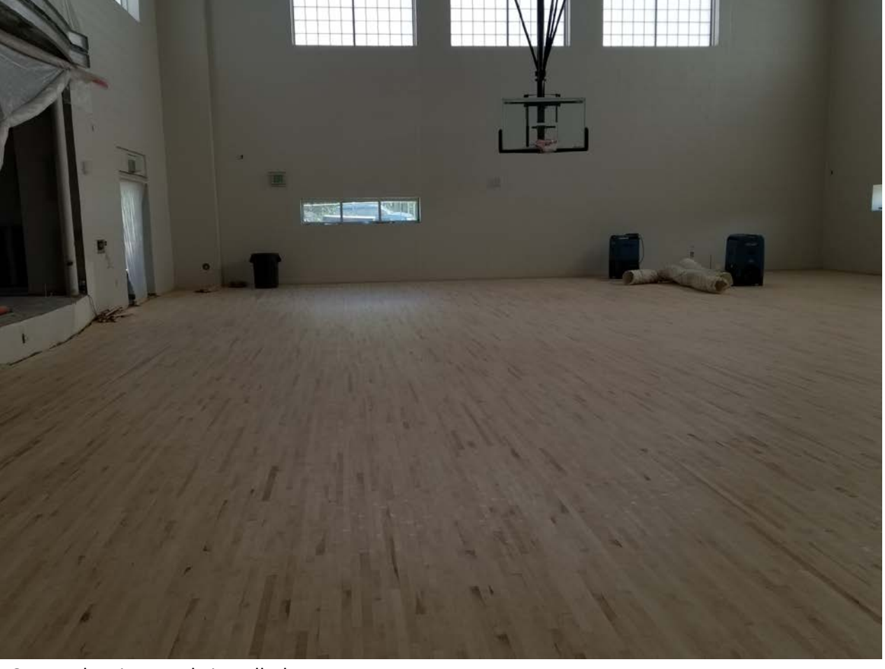
Gym – Flooring newly installed.