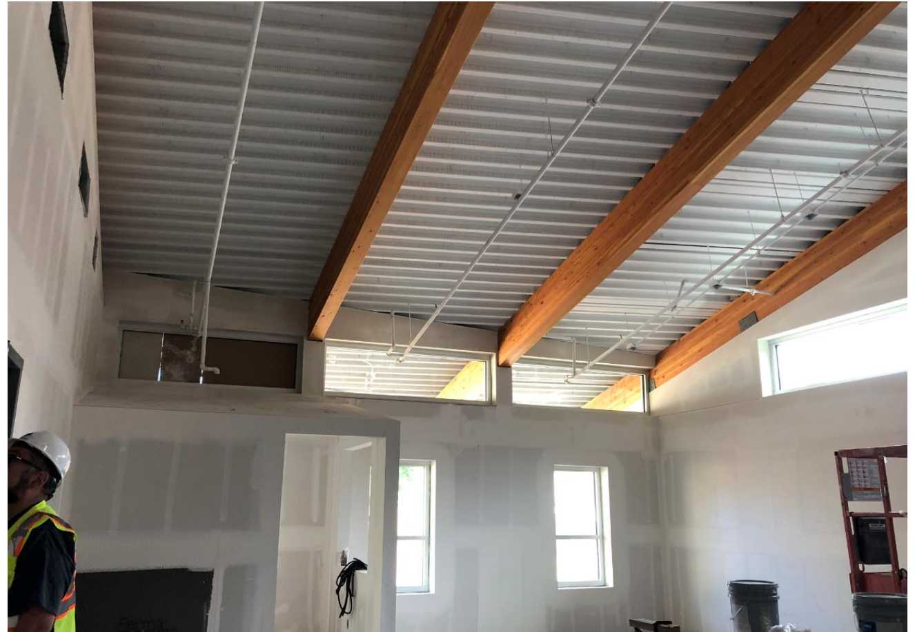
East wing ceilings painted.