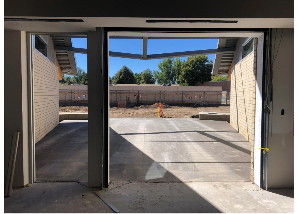
Multi-purpose areas looking out.