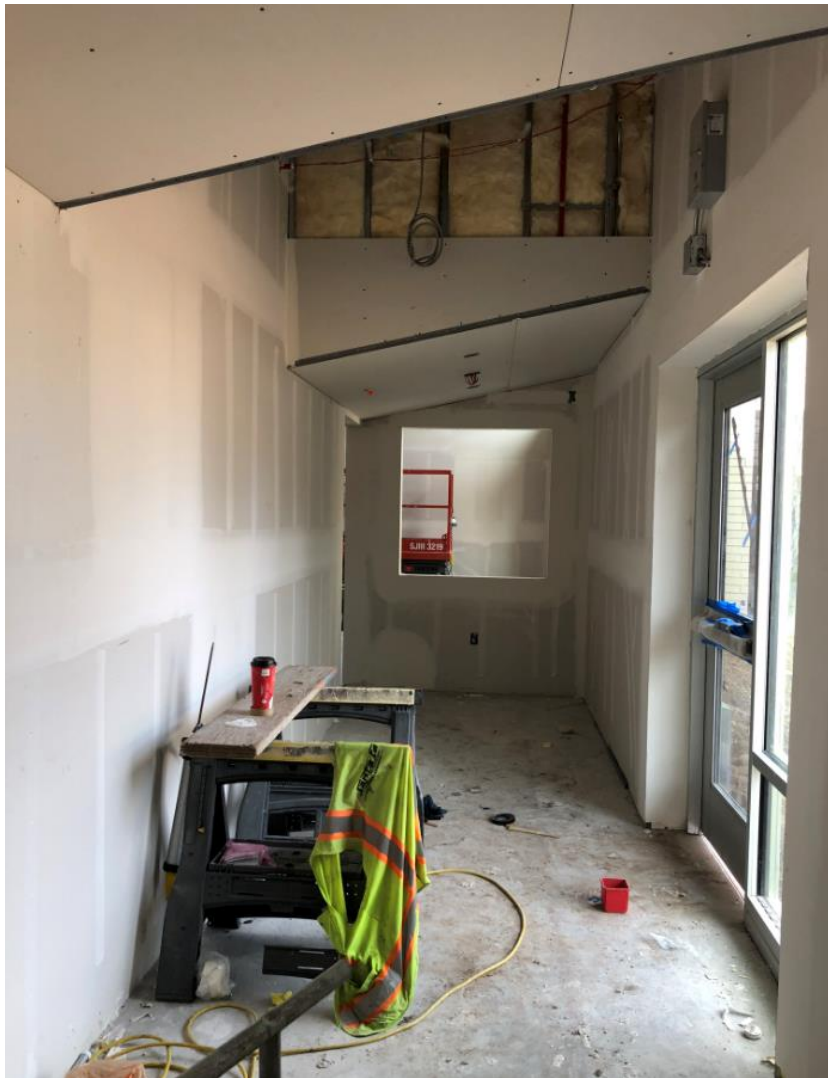
Mud room between classrooms.