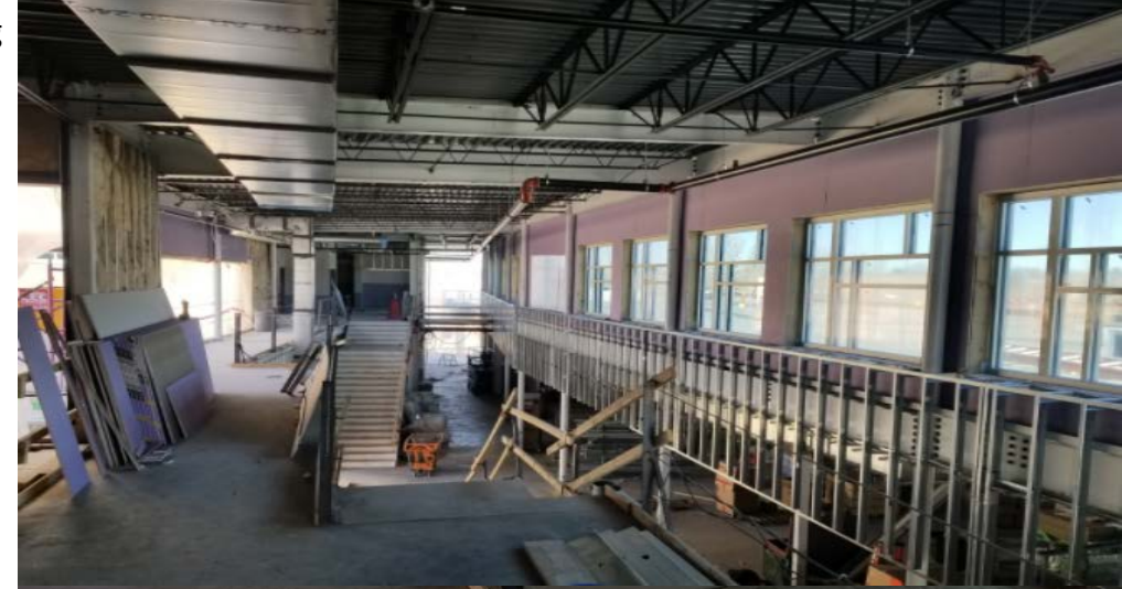
Grand Hall – North Facing View; Framing and drywall install continues