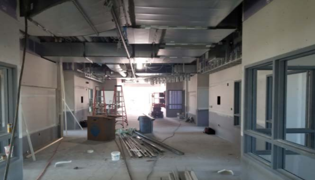
North Classroom Wing (upper level) – West Facing View; Drywall and HVAC installed; Drywall for soffit to begin