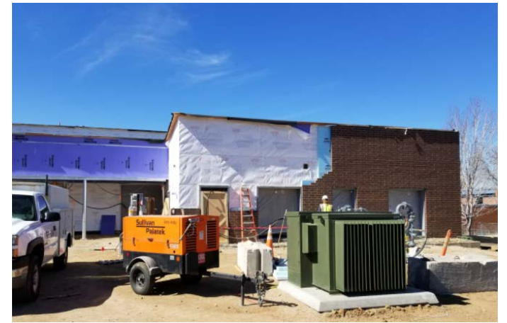
Northeast Elevation; Brick installation continues