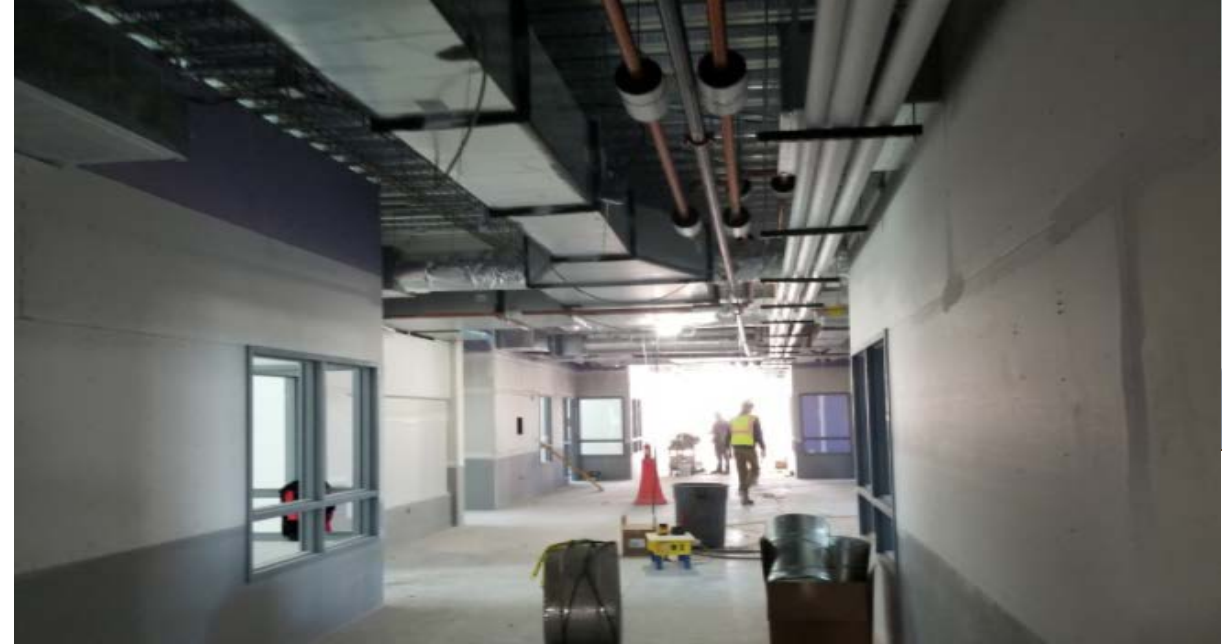
North Classroom Wing (lower level) – West Facing View; Drywall complete and painting to begin soon