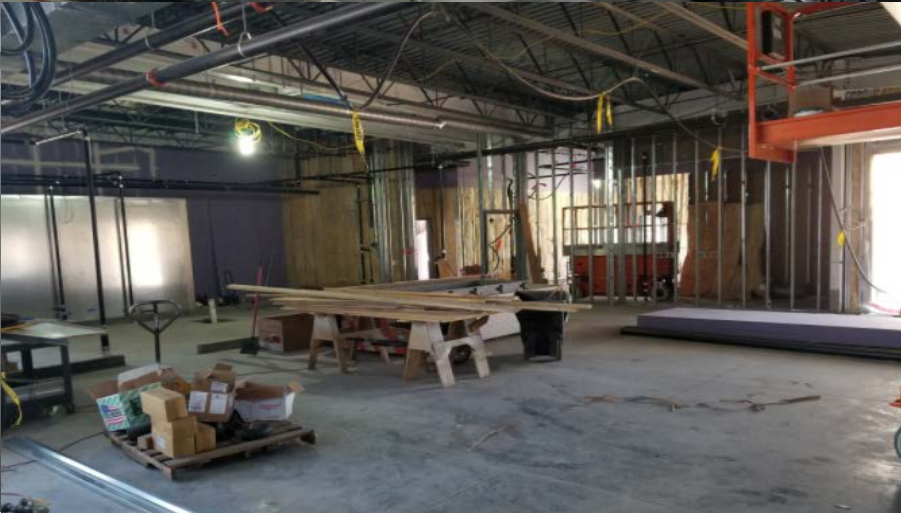
Kitchen and Cafeteria – North Facing View – Framing and insulation install continues