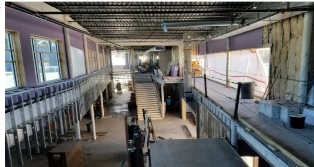
Grand Hall – South Facing View; Framing and drywall install continues