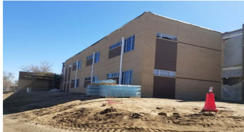
North Classroom Wing – Northwest Elevation; Brick, windows, and frames installation continues