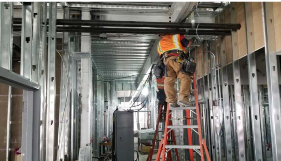
South Classroom Wing (lower level) – West Facing View; Framing, mechanical, electrical and plumbing install continues