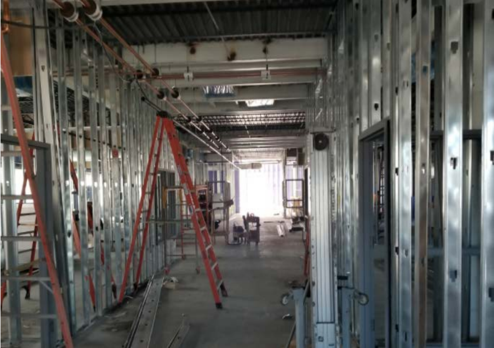
South Classroom Wing (upper level) – West Facing View; Framing, HVAC, install continues