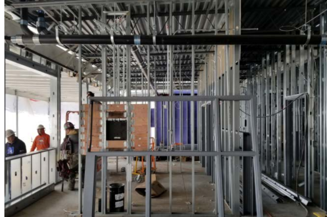
Office Area – West Facing View; Framing, mechanical, and electrical install continues