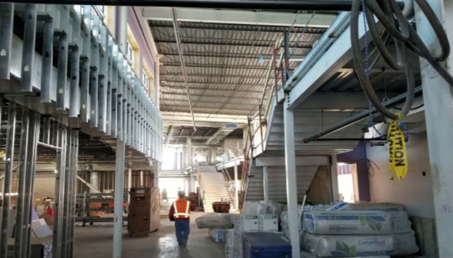
Grand Hall – South Facing View; Framing, mechanical, and electrical install continues