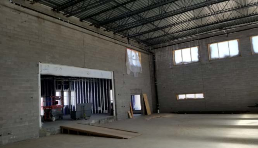
Gym – North Facing View; Windows and frames install continues