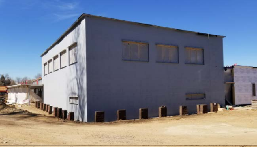
Front Entrance / Gym – Southeast Elevation; Brick, windows, and frames installation continues