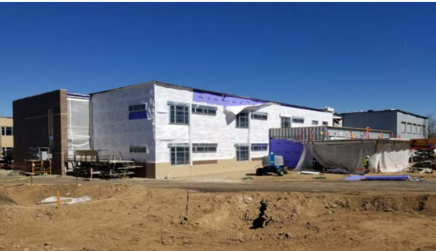
Front Entrance – Southwest Elevation; Brick, roof and parapet installation continues