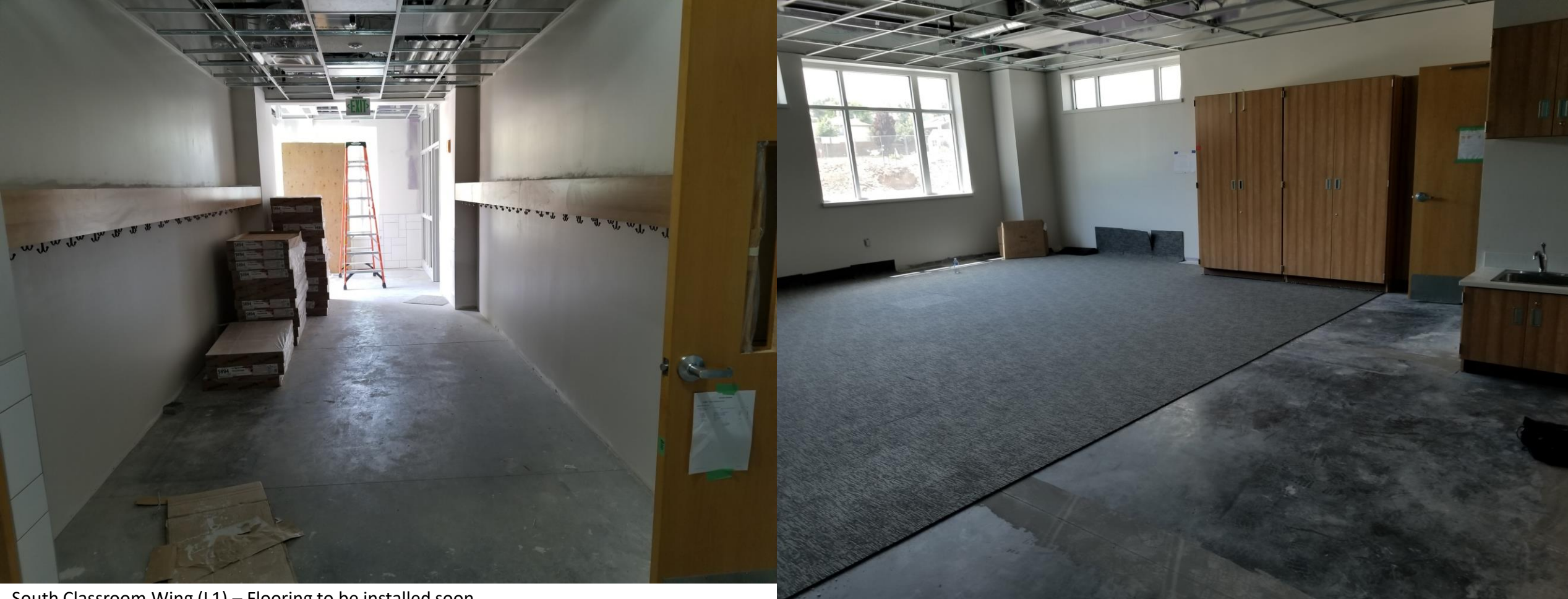
South Classroom Wing (L1) – Flooring to be installed soon.