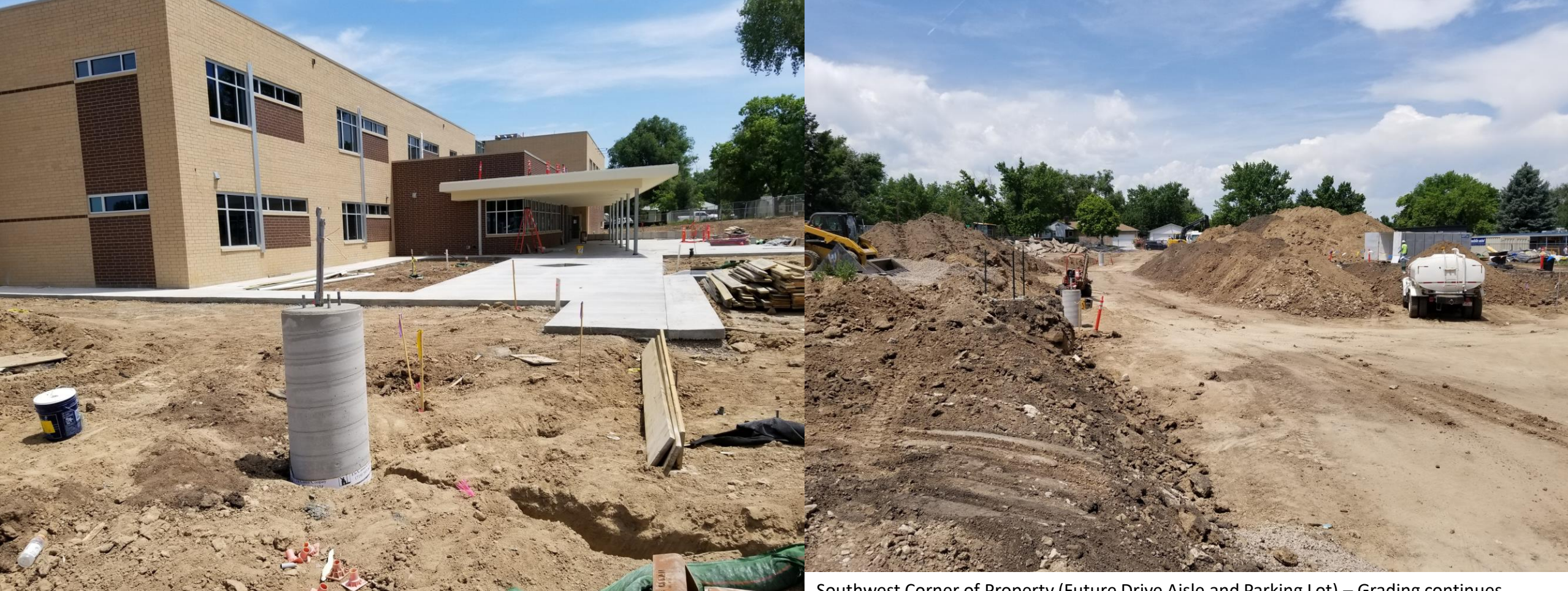
South Elevation – Main Entrance; Concrete work continues and installation of light poles.

Southwest Corner of Property (Future Drive Aisle and Parking Lot) – Grading continues and installation of light poles.