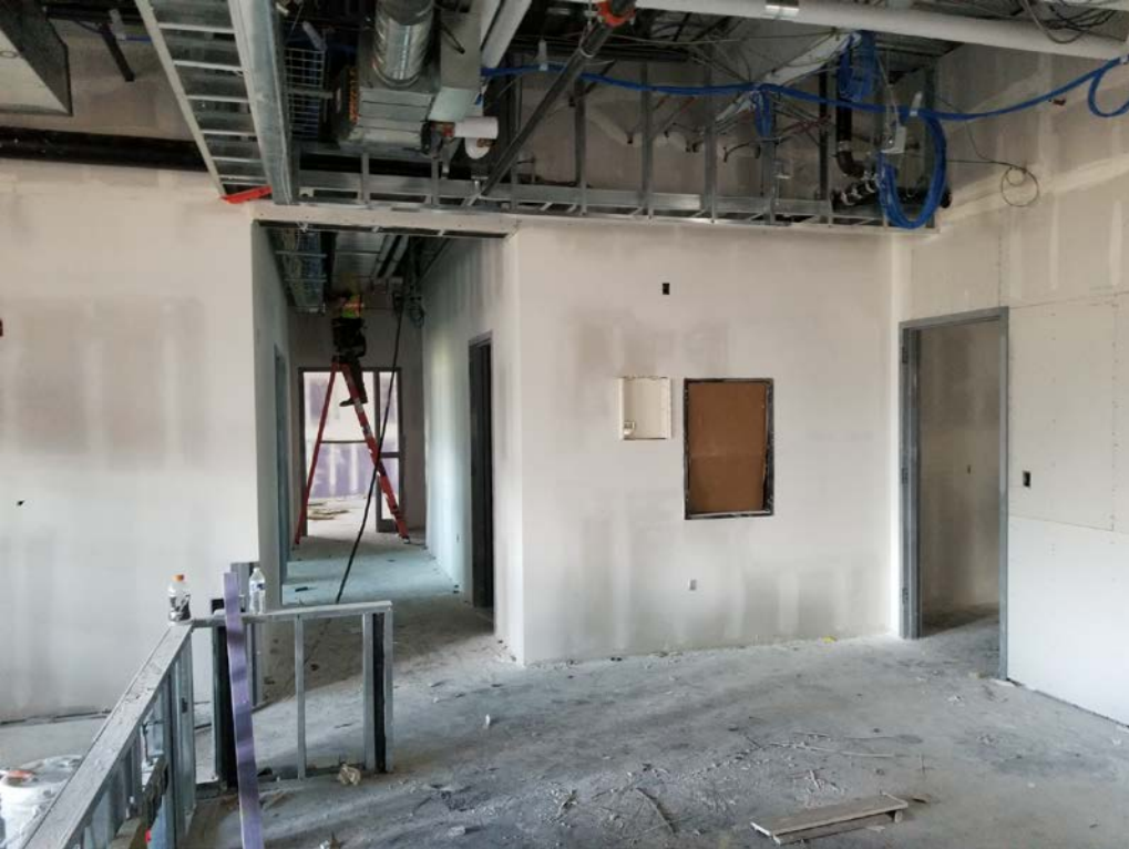
Reception Area – HVAC, electrical and drywall install continues