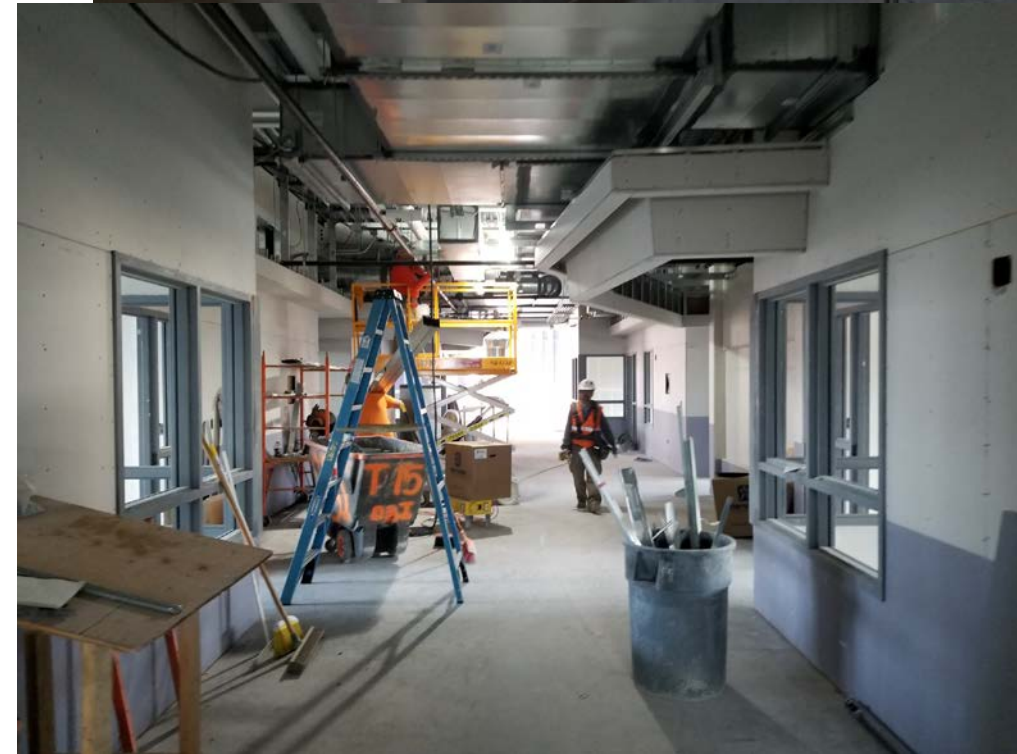
South Classroom Wing (upper level) – Classroom; HVAC work continues, paint next