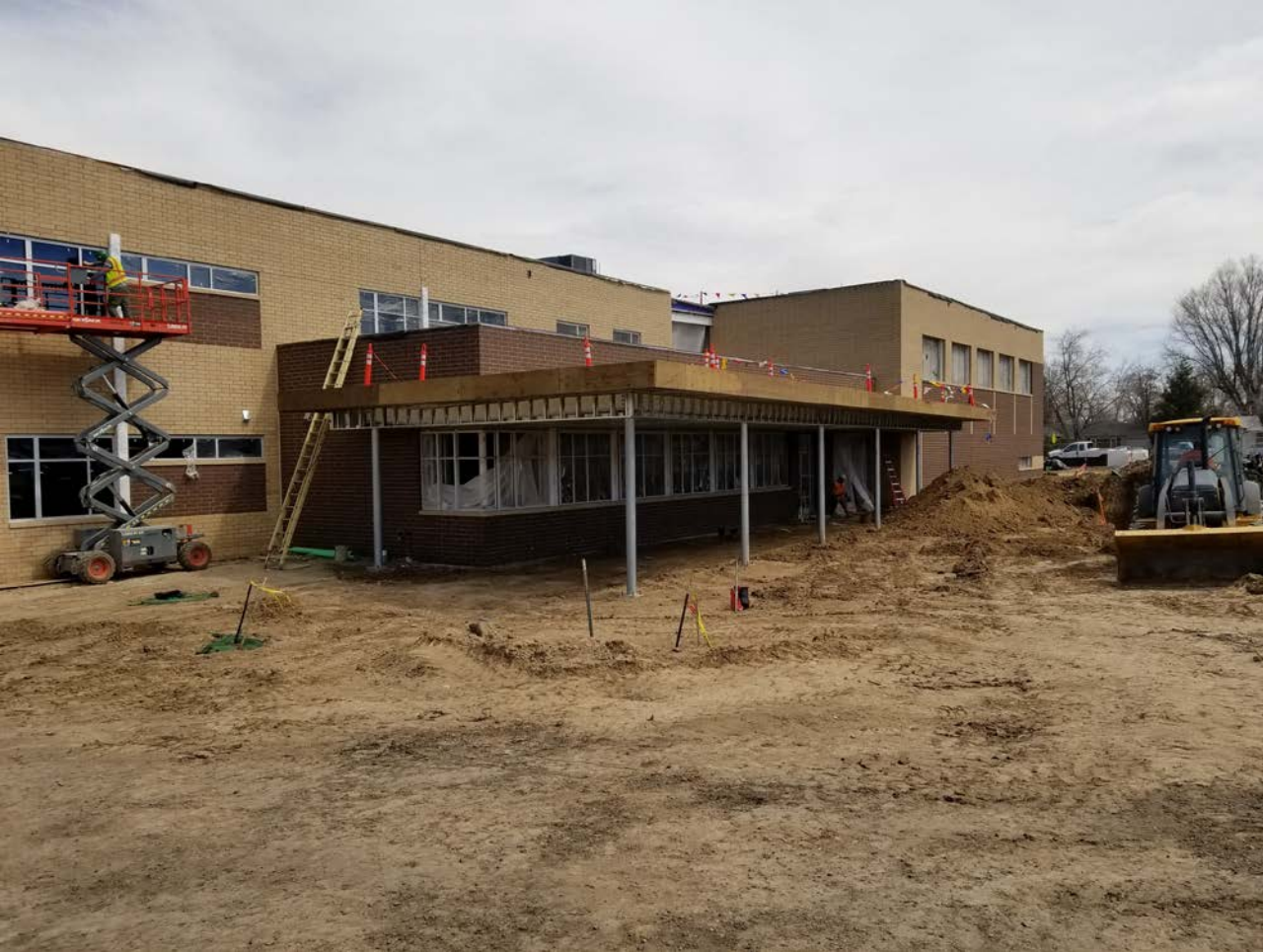
Front Entrance – South Elevation; Window install and sitework in progress