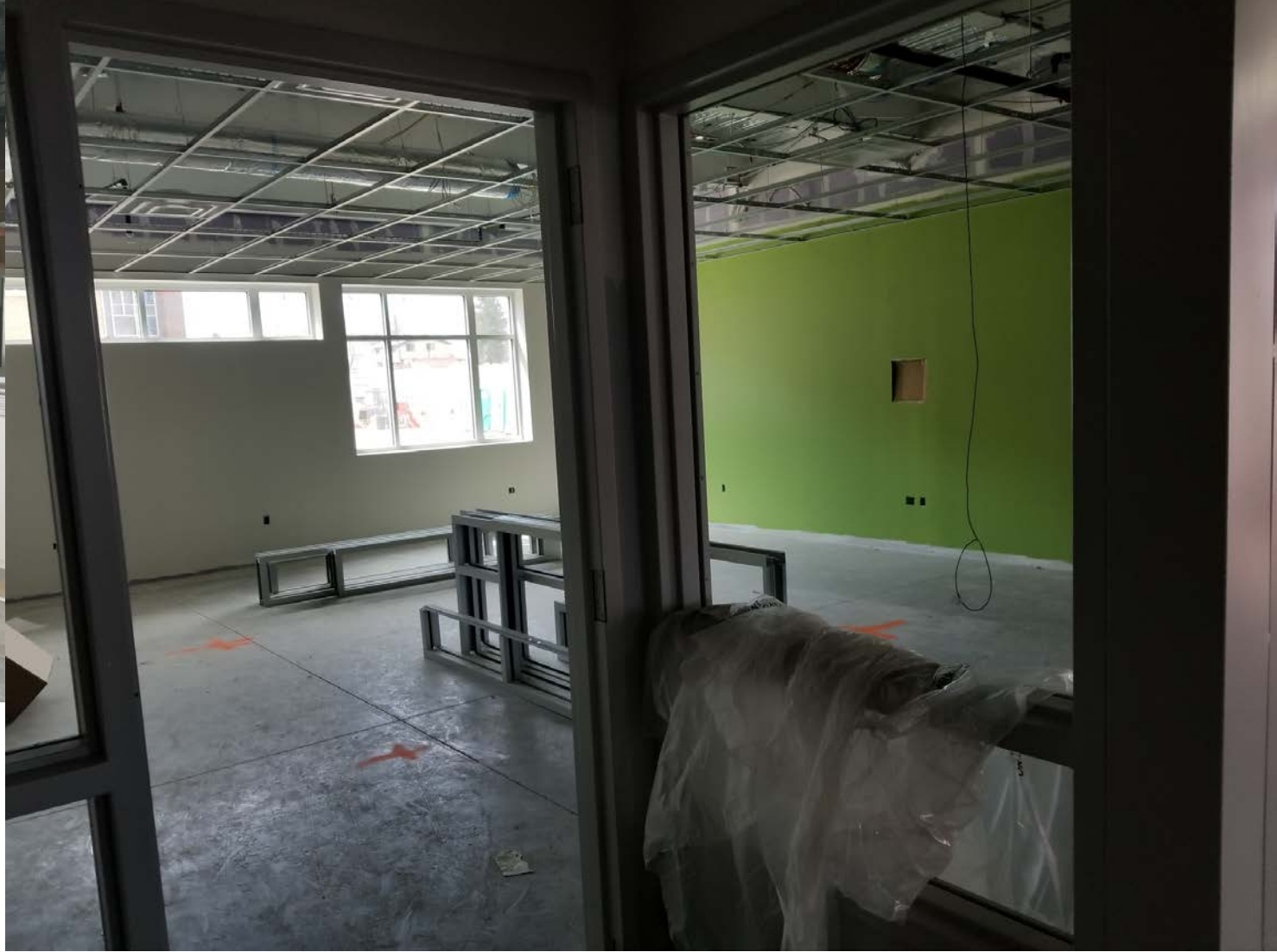
North Classroom Wing (lower level) – Classroom; Ceiling install