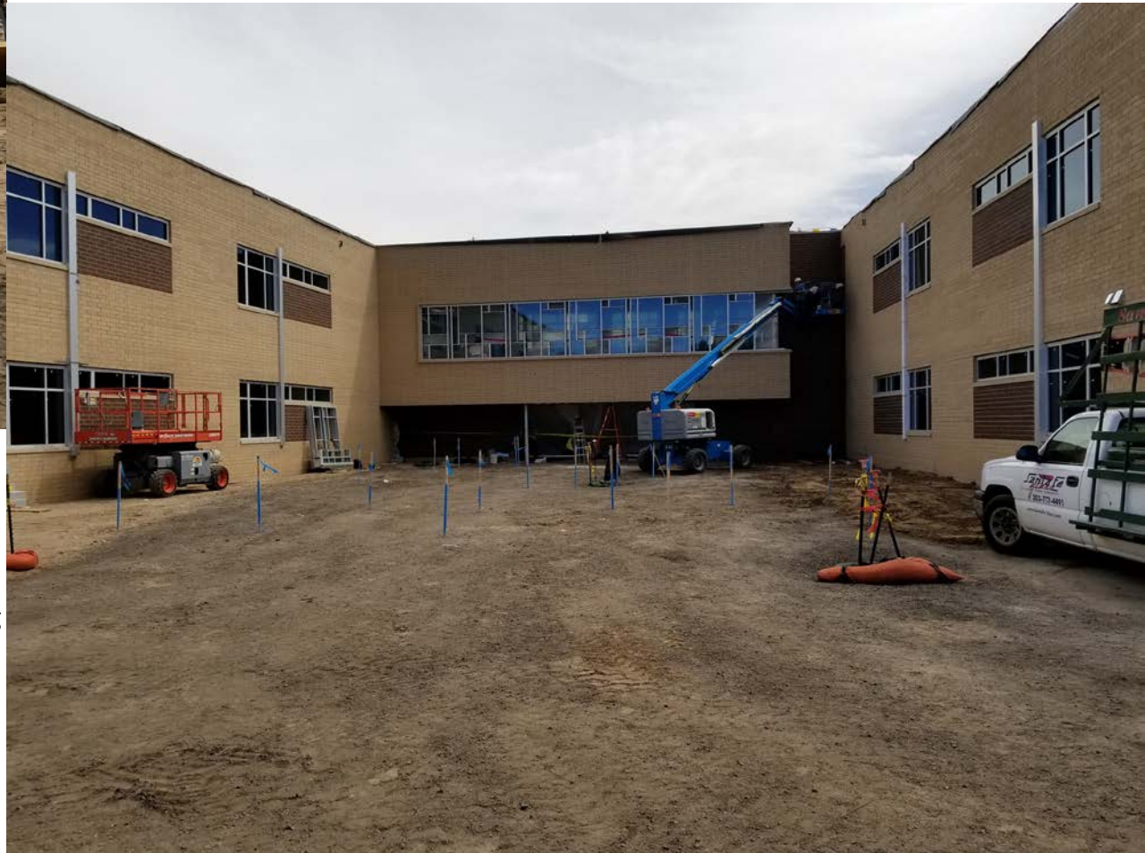
West Elevation – Plaza Between Classroom Wings; Windows being installed