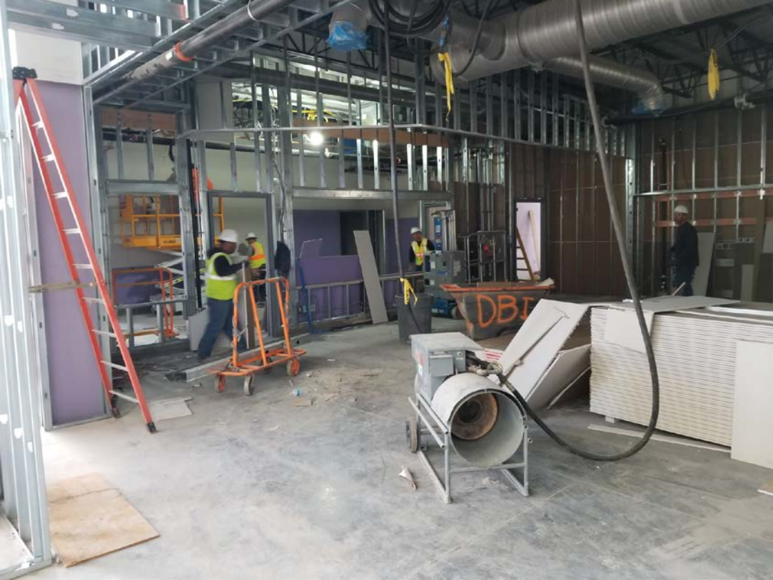
Cafeteria – Framing continues