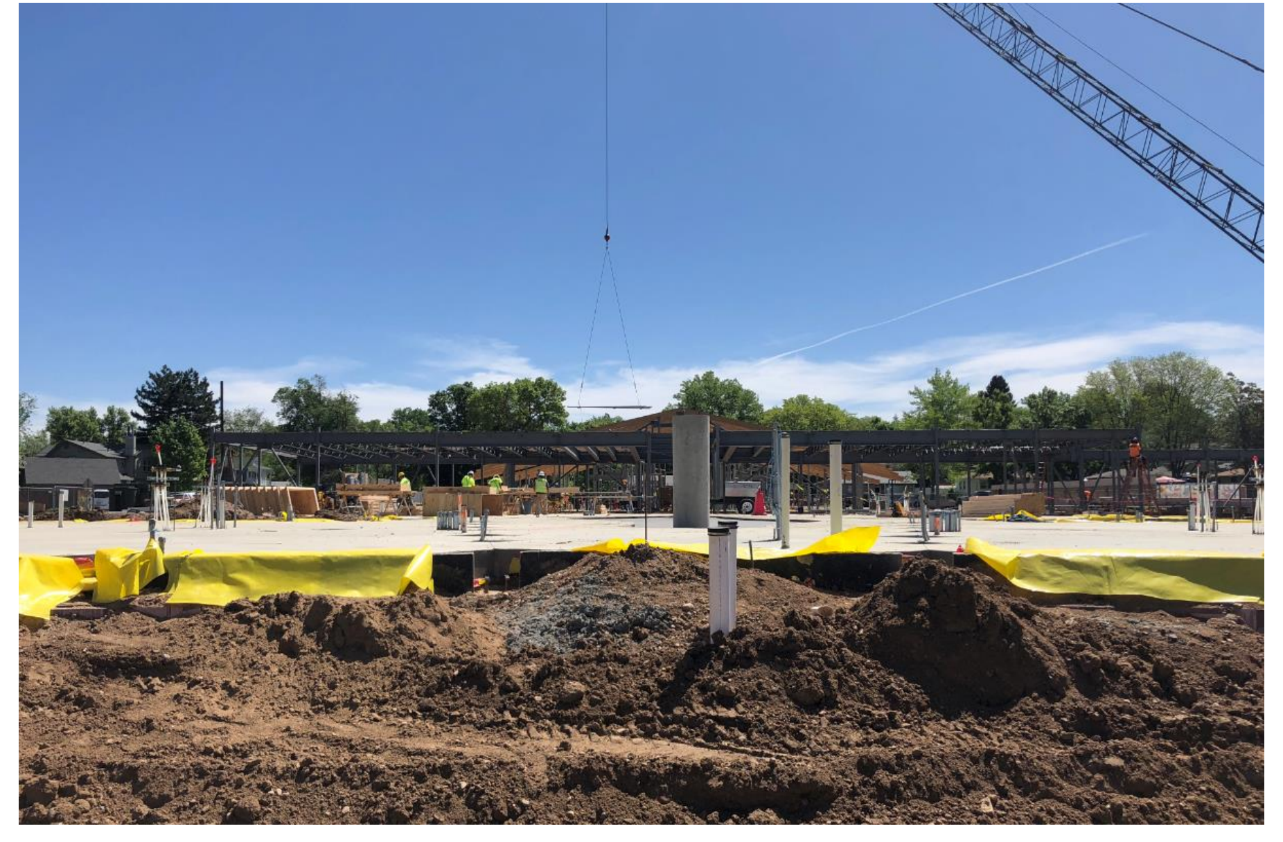
Looking East across building.