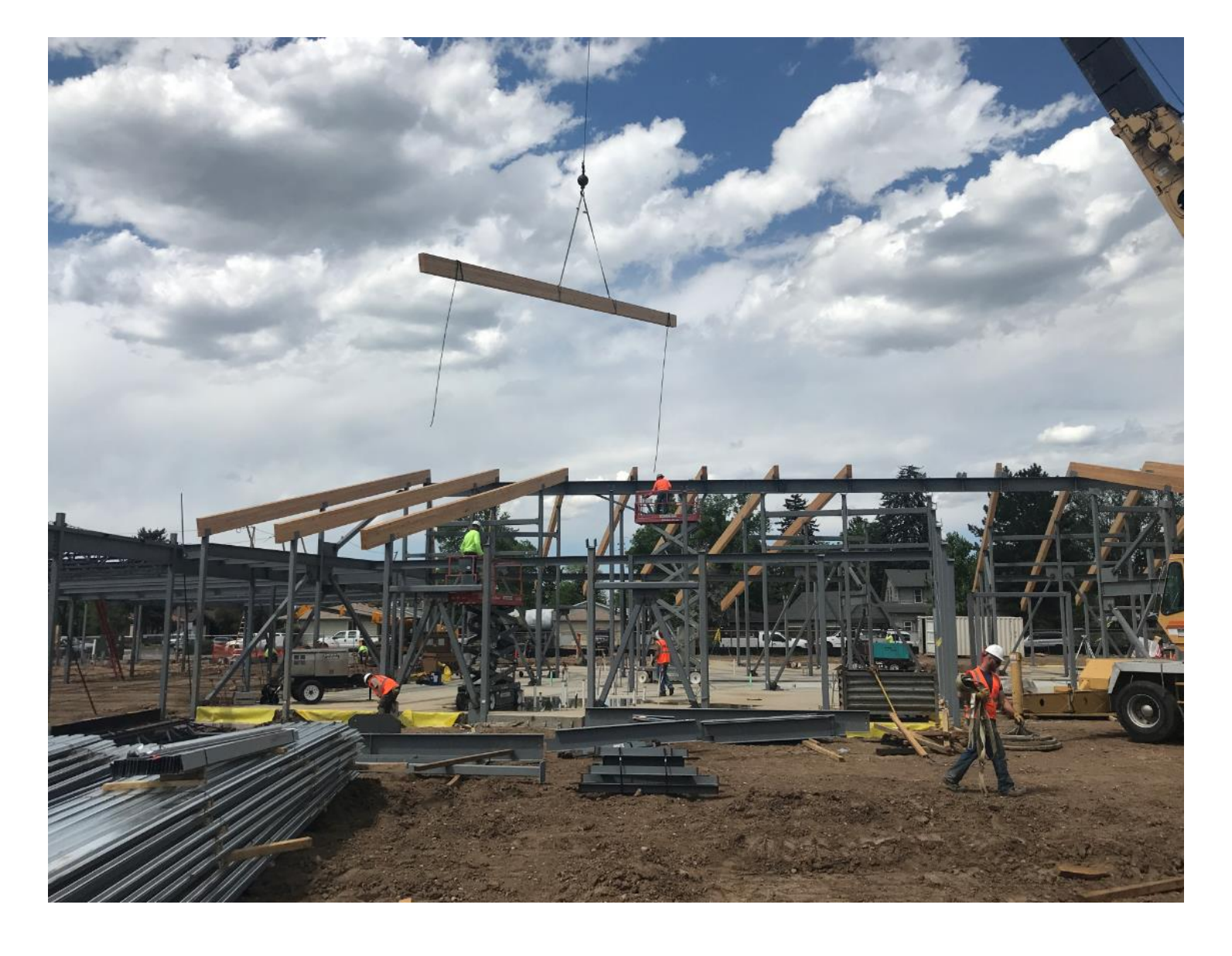
Glulam (glued laminated timber) beam installation.