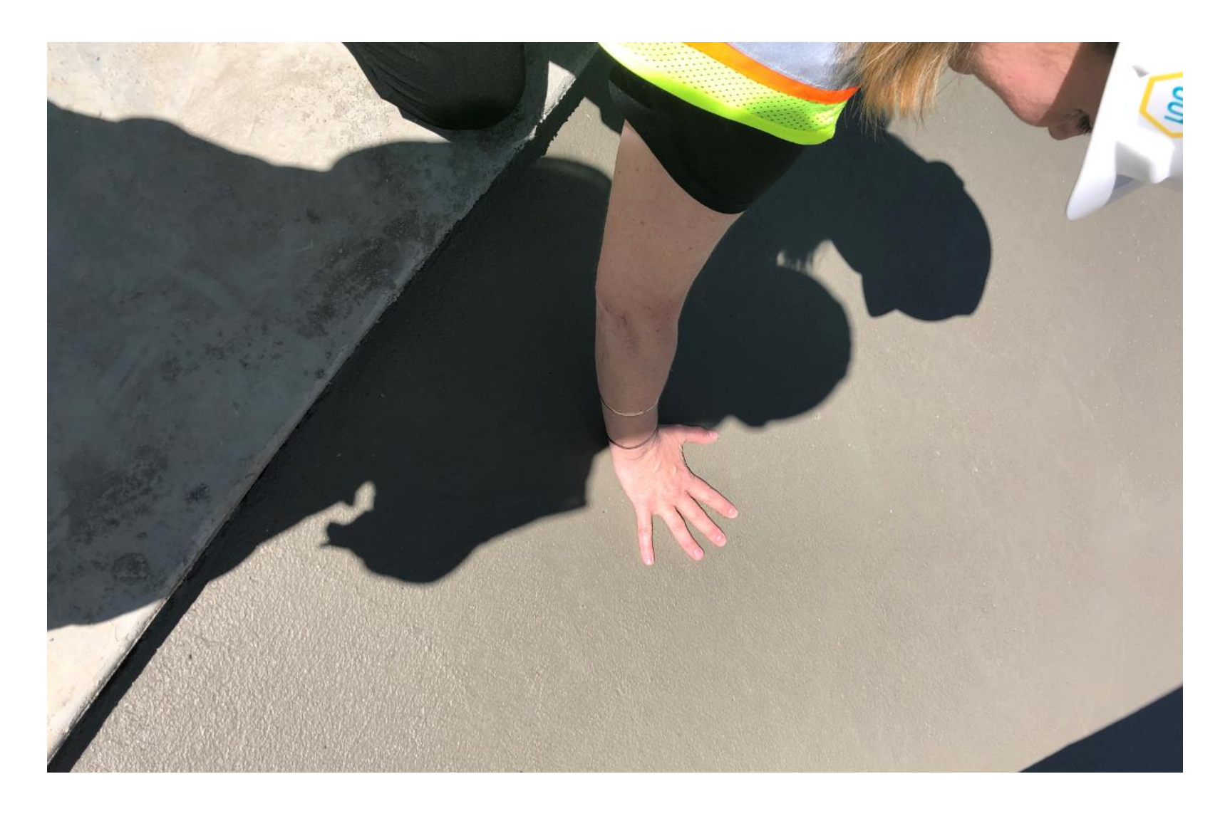
Leaving behind a few handprints.