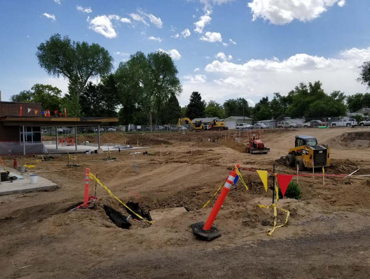
South Elevation – Main Entrance; Sitework continues.