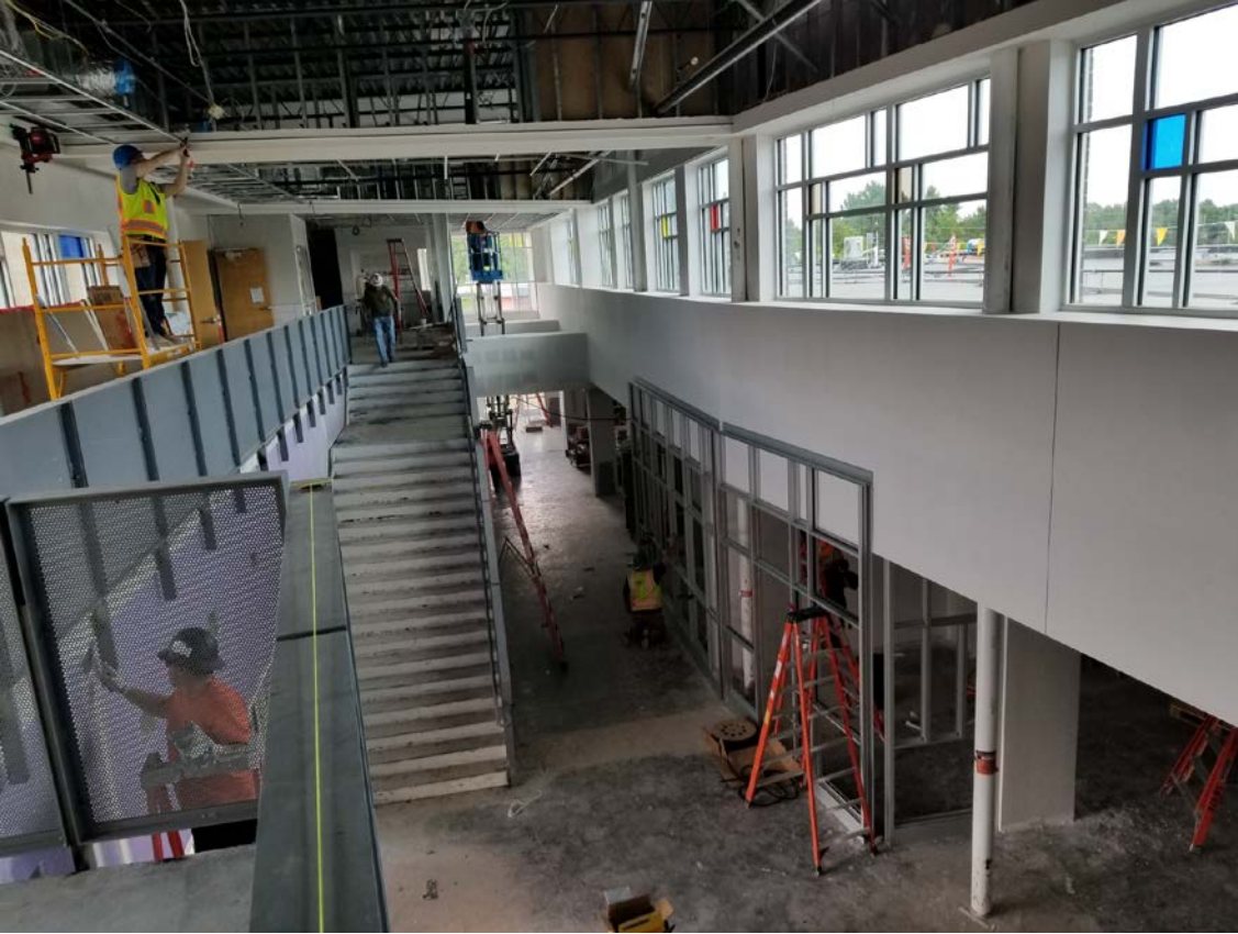
Grand Hall – North Facing View; Walkway panels newly installed, storefront frames on lower level and ceiling being installed and painting in progress.