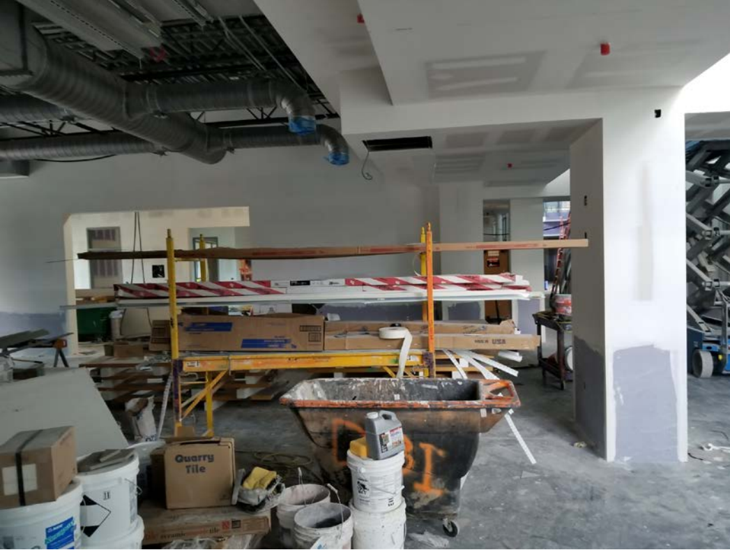
Cafeteria – Painting, mechanical, and electrical work continues.