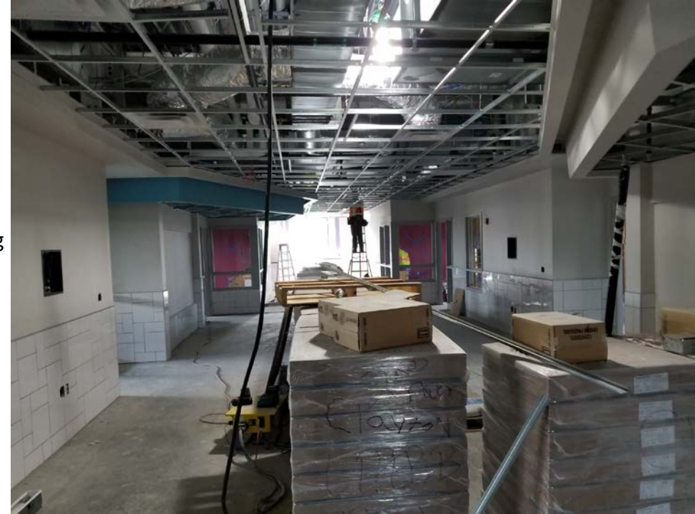
South Classroom Wing (upper level) – Flooring to be installed soon.