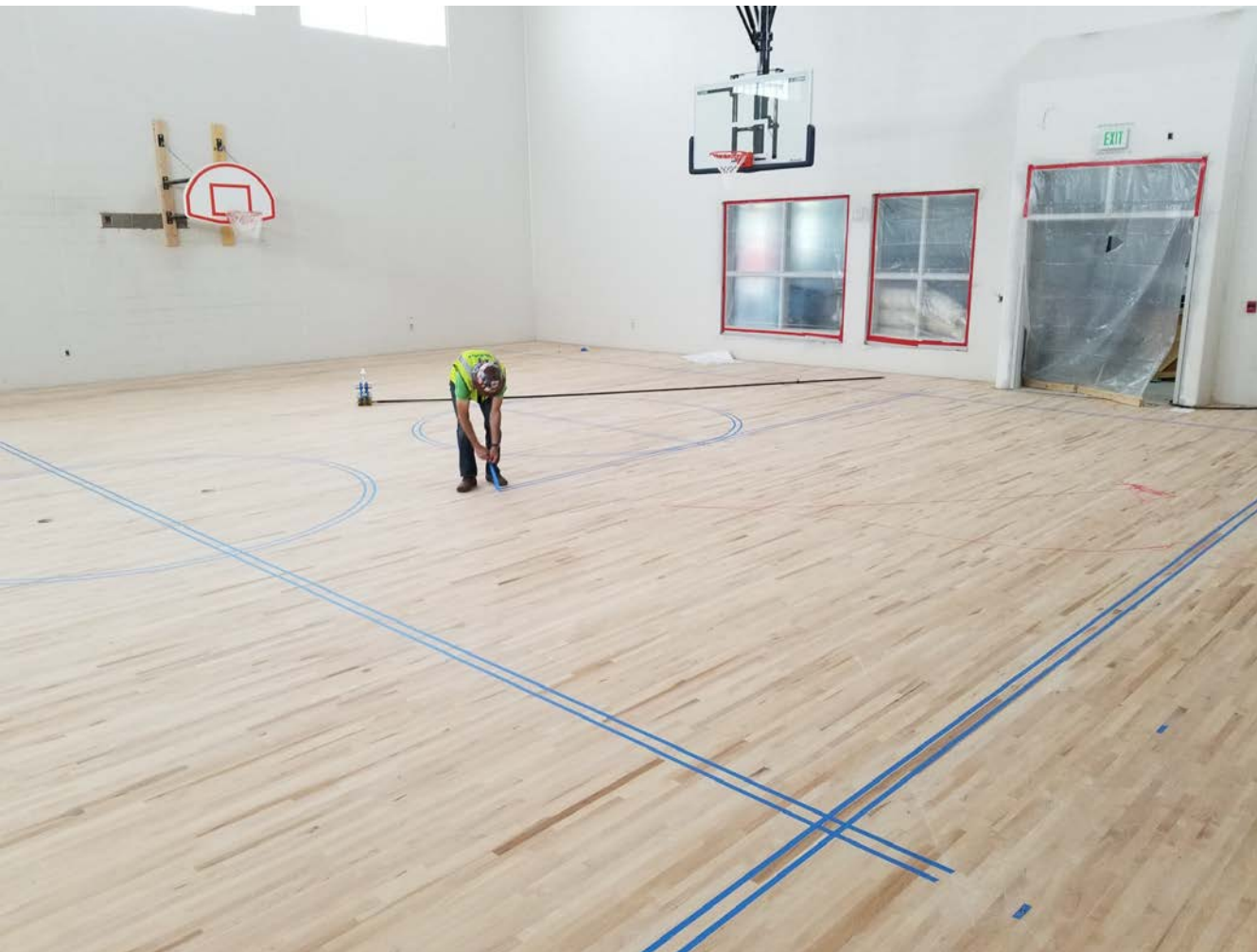
Gym – Flooring being taped for striping.

Admin/Teacher Area – Flooring to be installed soon and painting in progress.