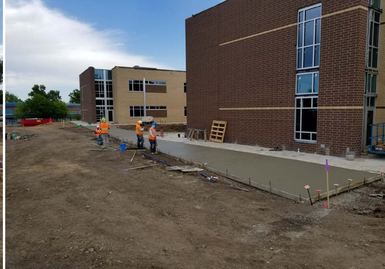
West Elevation – Sitework continues, concrete newly poured.