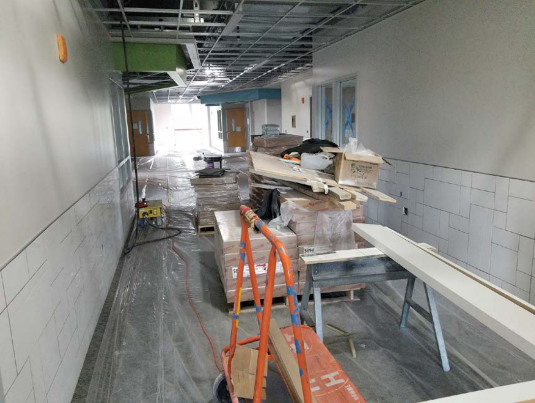
North Classroom Wing (upper level) – Carpet newly installed and ceiling tile to be installed soon.