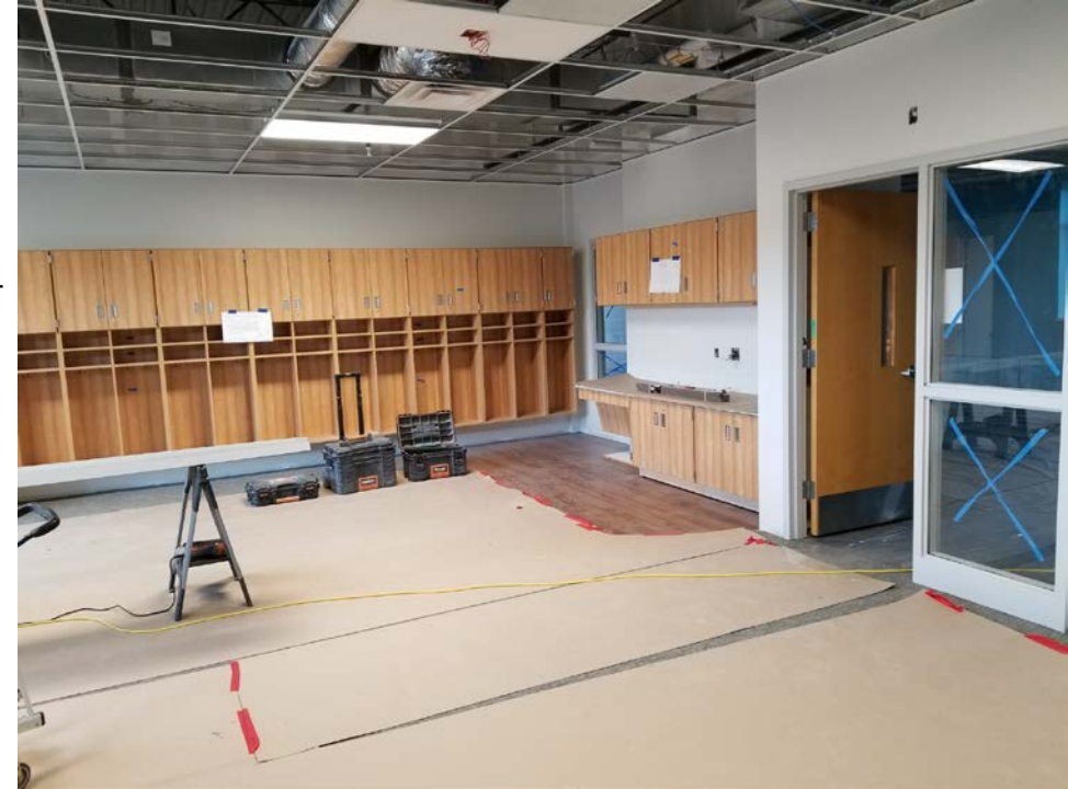
North Classroom Wing (upper level) – Classroom; Ceiling tile to be installed soon.